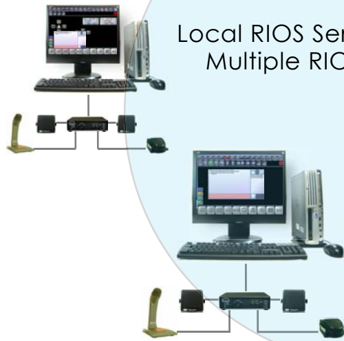
Local RIOS Server IP Network with Multiple RIOS Client Positions