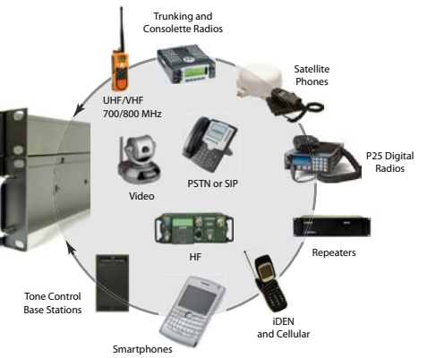
Radio Entry Points and/or IP Virtual Assets (Customer Supplied)

RIOS Client operates with all RIOS Server platforms including the RIOS 6PRT, RIOS TAC2 and RIOS SR-3000 Series.