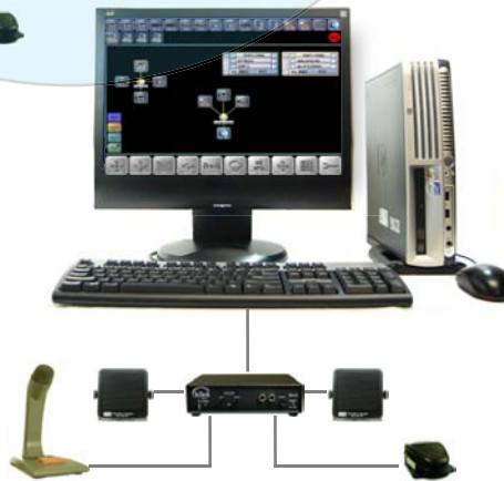
RIOS CCU2 Audio Control Package R-CON-PACK