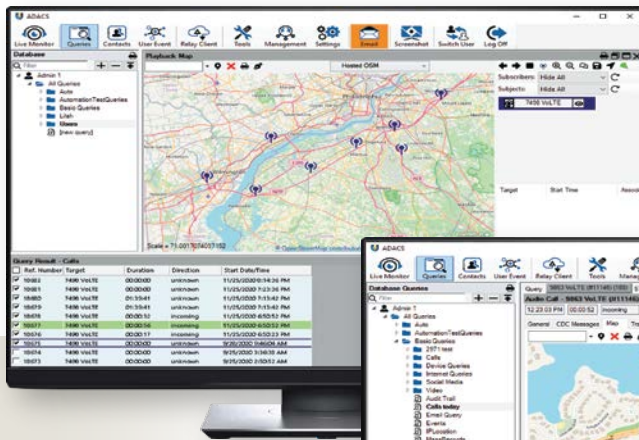
IP Geo Tracking

ADACS delivers a full range of intercept, tracking and analysis capabilities designed for the unique nature of evidentiary voice, video and data collection.