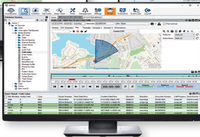
Title III Voice & Message Monitoring